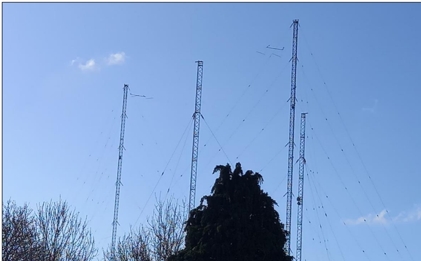
Tops of the Droitwich masts as seen from nearby Webbs of Wychbold Garden Centre, February 2023 (TR)